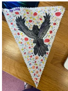
Lacey Anne's bunting celebrates Coventry