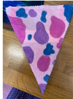
A super festival vibe from Ellie