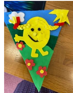
Can you guess who has made this one?