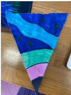
Miley's bunting celebrates Sowe Valley School